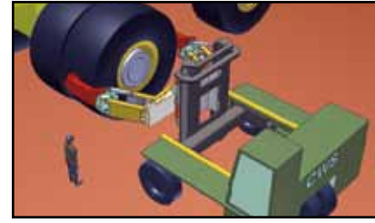
SHOP TIRE MANIPULATOR