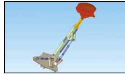
BUCKET CLEAN OUT TOOL