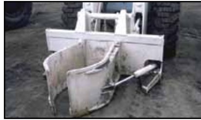
BLAST HOLE STEMMERS