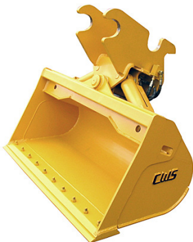
Side Tilt Bucket