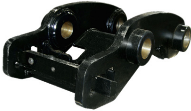
Manual Wedge Coupler